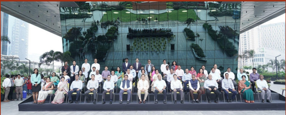
Figure F: Capacity Building Workshop for State Government Departments

Capacity building with up-to-date knowledge and market shifts is necessary for business to adapt and sustain. Thus, it is necessary for incubators, mentors, investors and Government departments to transform their knowledge bases in order to assist Startups in their growth journey. To augment this knowledge upgradation, Startup Telangana has organised 20+ workshops for capacity building of incubators, potential investors, and State Government departments.