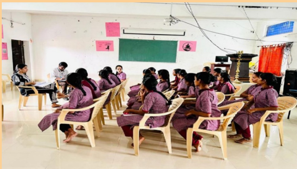
Figure D: Students attending Entrepreneurship Sessions