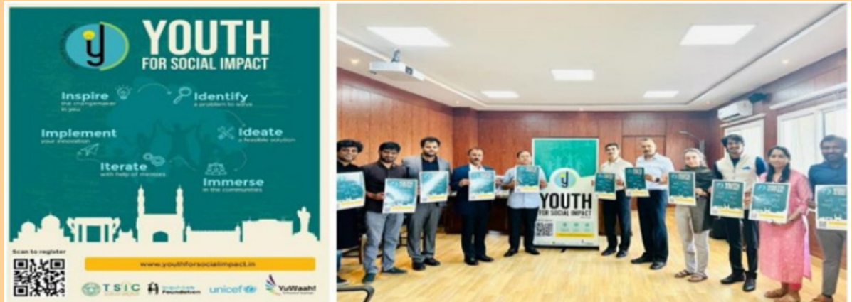
Figure B: Event Launch - Youth for Social Impact