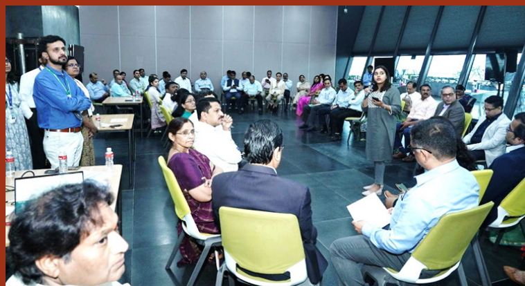
Figure G: Telangana State Innovation Council (TSIC) - Government Interaction Workshop