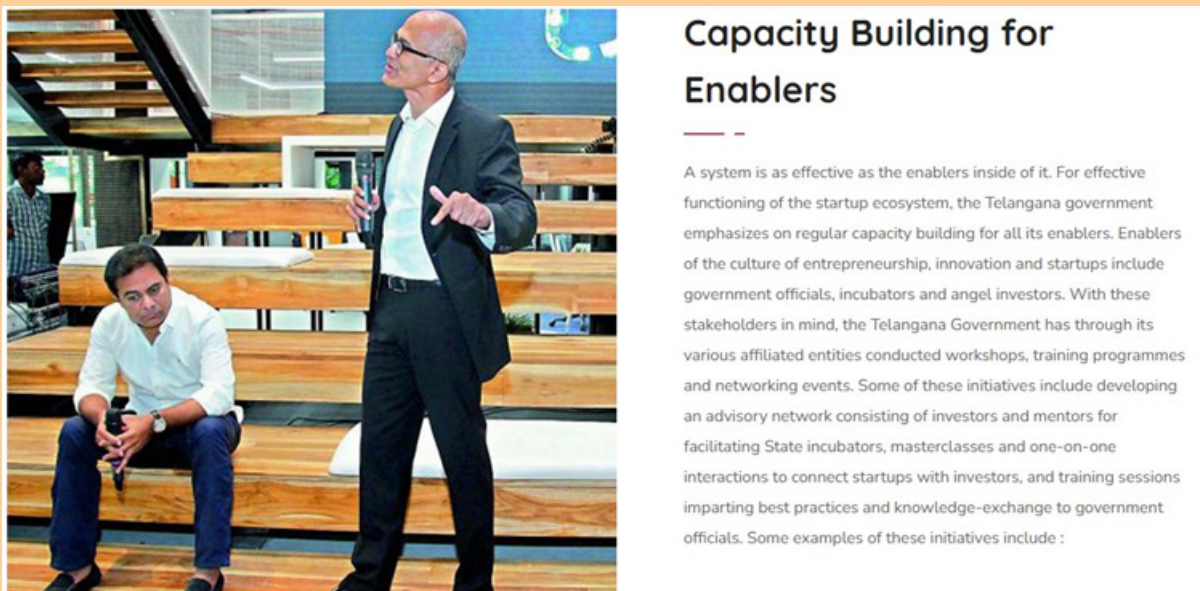
Figure E: Webpage for Capacity Building for Enablers