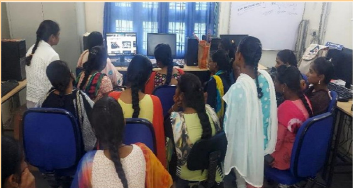
Figure C: Women Entrepreneur Sessions in Government Colleges